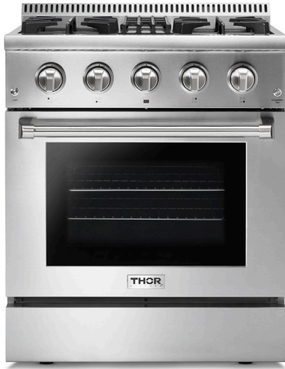
Product: 30 Inch Professional Dual Fuel Range in Stainless Steel Model Number: HRD3088U / HRD3088ULP