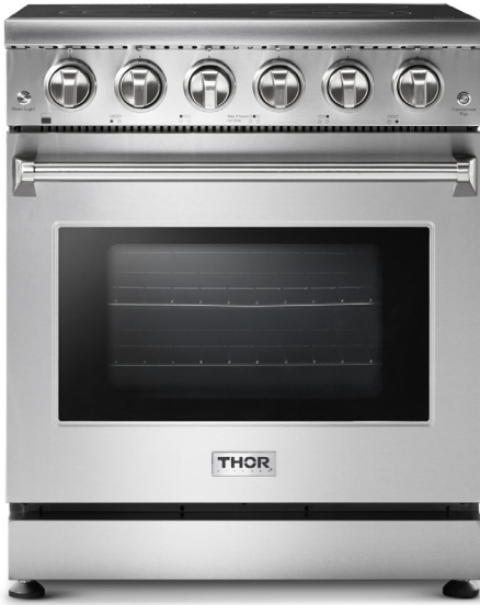
Product: 30 Inch Professional Electric Range in Stainless Steel Model Number: HRE3001