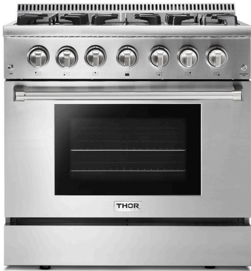
Product: 36 Inch Professional Dual Fuel Range in Stainless Steel Model Number: HRD3606U / HRD3606ULP