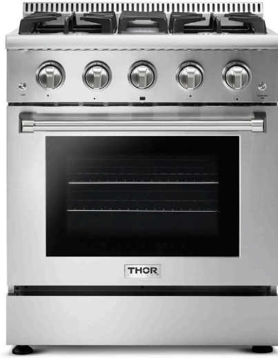
Product: 30 Inch Professional Gas Range in Stainless Steel Model Number: HRG3080U / HRG3080ULP