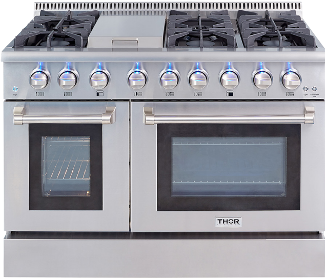
Product: 48 Inch Professional 6 Burner Gas Range in Stainless Steel Model Number: HRG4808U / HRG4808ULP