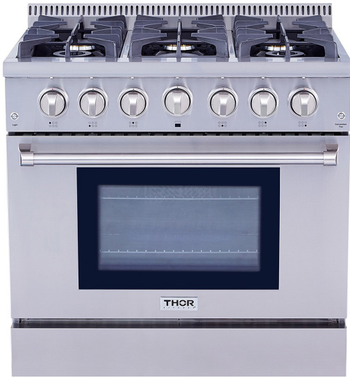
Product: 36 Inch Professional Gas Range in Stainless Steel Model Number: HRG3618U / HRG3618ULP