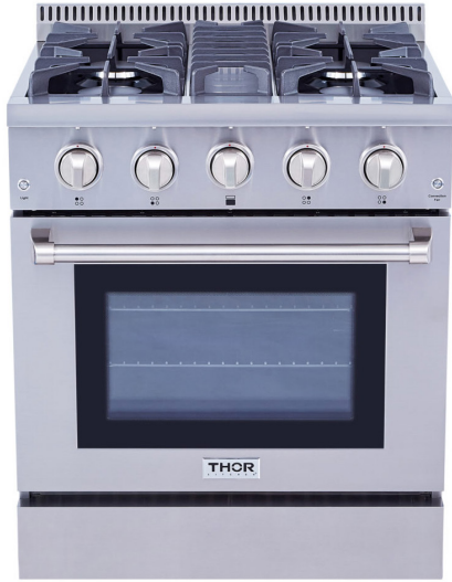
Product: 30 Inch Professional Gas Range in Stainless Steel Model Number: HRG3080U / HRG3080ULP