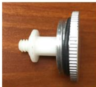
LP Position: Plastic Ring is away from the Cap