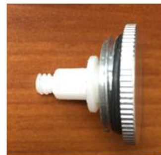
NG Position: Plastic Ring is next to the Cap